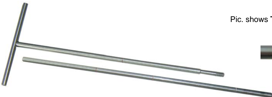
Pic. shows Thread screw connection