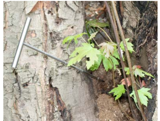
Pic. shows IML Probe Rod with application